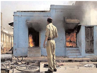
Rioters moved with impunity

Modi was the Chief Minister at the time of 2002 genocide