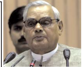
Sh. Vajpayee was the Prime Minister

Modi was the Chief Minister at the time of 2002 genocide